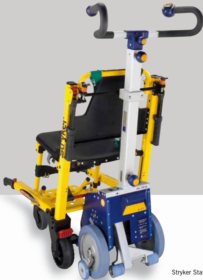
Stryker Stair-PRO 6251

The stair climber s-max can be attached (also retroactively) to a great number of chairs. Depending on the chair's frame and dimensions, either the s-max with a total load of 160 kg or 135 kg (always maximum total weight approved) is used.