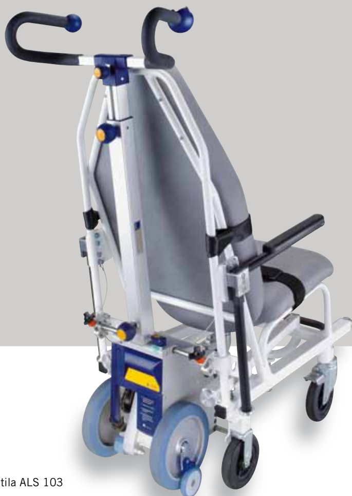
Utila ALS 103