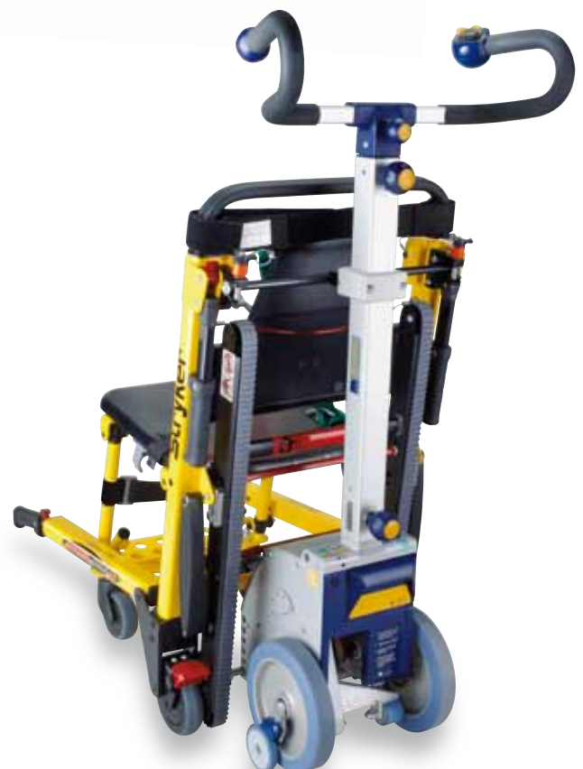
Stryker Stair-PRO 6252

Special installations provide a safe place inside the ambulance for each unit.