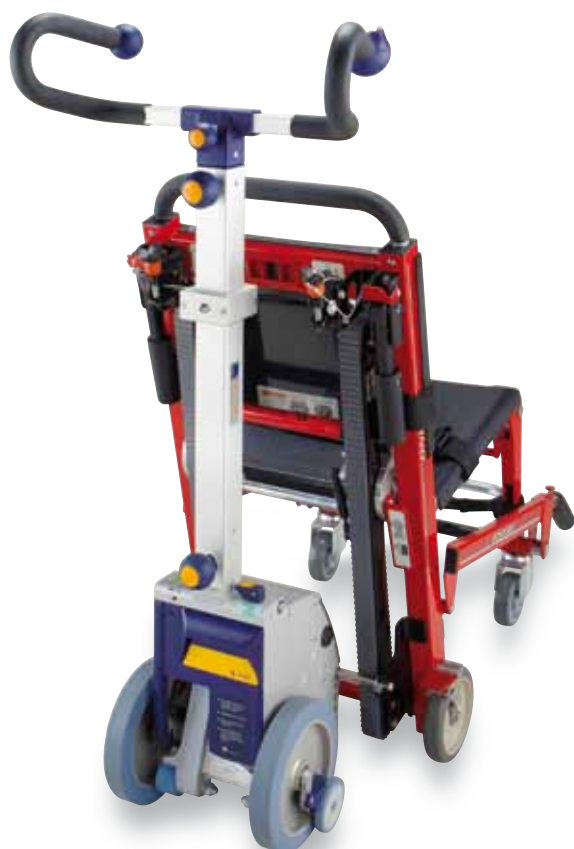
FERNO 59 T

Minimize your personnel’s absences from work and the thus resulting increased costs. The stair climber does not only relieve your staff but it also helps to keep costs from increasing.