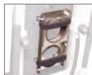
Holding device for oxygen