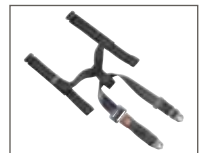
Seat belt system including hip belt